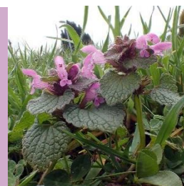
Red Dead Nettle.

Lamium purpureum This has purple flowers in rings around the stem. Each flower has a hood-like petal at the top and two lower petals. The leaves have short stalks. They are hairy, heart-shaped and with toothed edges. Red dead nettle is found on waste ground, alongside arable land, gardens and along hedges and roads. The plant has a square stem. It looks like a small nettle but does not sting, hence the name "dead".