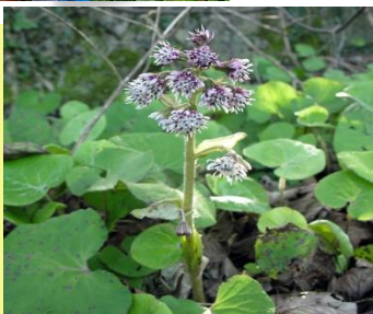
Winter heliotrope. Petasites fragans

If you're really good at finding flowers, you can join the Wild Flower Society. You will get a diary where you can record all of your plant finds, earning badges for the number of plants you can spot in a year. Go to thewildflowersociety.org.uk