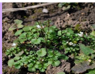
Hairy Bittercress Cardamine hirsuta.

This plant has very small white flowers, in a bunch at the top of a stem. The leaves are made of leaflets, in opposite pairs on either side of the stem. The leaves grow in a ring around the base and up the stem. The leaf stems are hairy. The plant can be eaten and has a strong taste. It can be found in gardens and waste areas where the soil is damp.